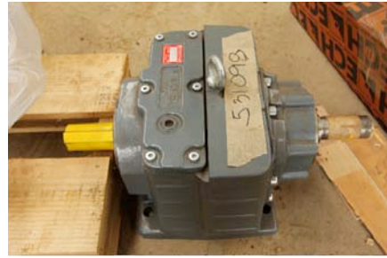
T3 Setup Gearbox