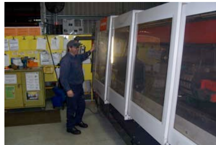
T3 CNC Cutting